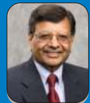
Dr Jagdish N Sheth Charles H. Kellstadt Professor of Marketing and Strategy Goizueta Business School, Emory University & Founder Chairman Academy of Indian Marketing (AIM), USA